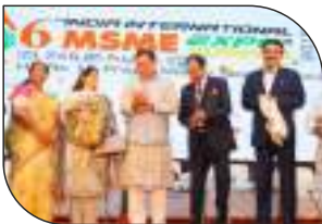
Sh. Satish Mahana, Minister of Industrial Development-2019