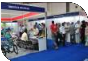
MSME Expo Stalls