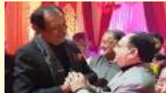
Sh. J. P. Nadda Minister of Chemicals and Fertilizers