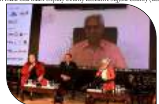
Sh. Sanjay Mishra, Indian actor & Sh. Ramesh Sippy, Indian film director and actor-2021