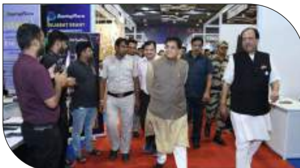
Sh. Piyush Goyal, Minister of Industry and Supply-2024