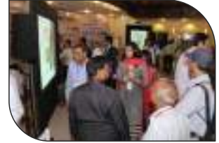
MSME Expo Stalls