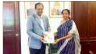
Smt. Nirmala Sitharaman, Union Finance Minister