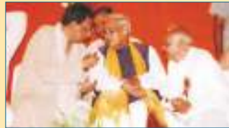
Sh. Atal Bihari Vajpayee Former Prime Minister of India