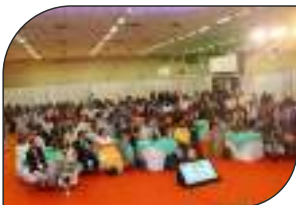
MSME Expo Conference Hall