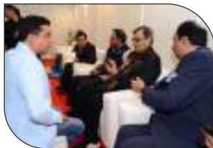
Sh. Subhash Ghai, Film producer-2019