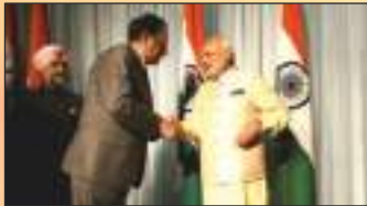
Sh. Narendra Modi Prime Minister of India