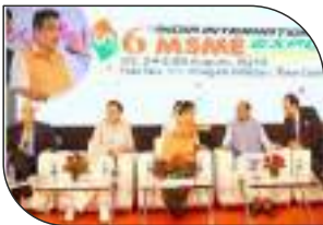
Sh. Nitin Gadkari, Minister of Road Transport and Highways-2019