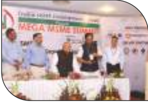
Sh. Kalraj Mishra, Former Minister of MSME