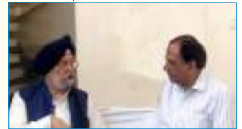
Sh. Hardeep Singh Puri Minister of Petroleum & Natural Gas,