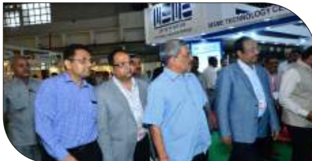
Sh. Manohar Parrikar, Former Minister of Defence-2015