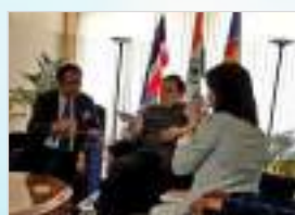
Embassy of Thailand