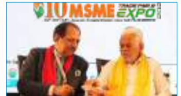
Sh. Parshottam Rupala Union Minister of Animal Husbandry, Dairying and Fisheries