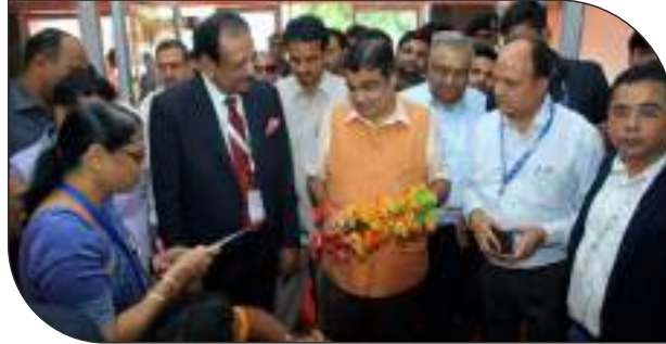
Sh. Nitin Gadkari, Minister of Road Transport and Highways-2019