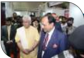
Sh. Manoj Sinha, Lieutenant Governor of Jammu and Kashmir-2022