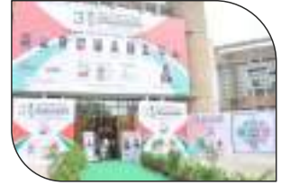
MSME Expo Entry Gate-2016