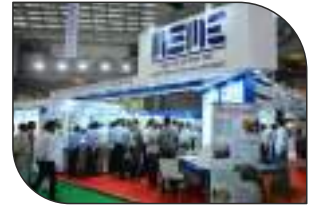
MSME Expo Stalls