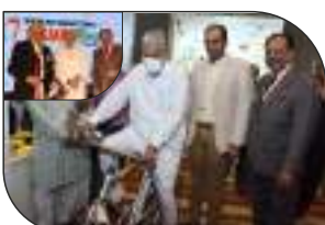
Sh. Parshottam Rupala, Former Minister of Fisheries, Animal Husbandry and Dairying