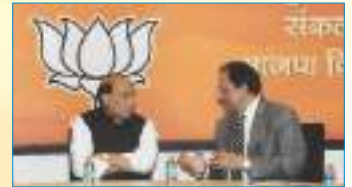
Sh. Rajnath Singh, Union Defence Minister