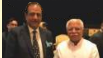
Sh. Manohar Lal Khattar Minister of Housing, Urban Affairs & Power