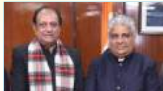
Sh. Bhopender Yadav Union Cabinet Minister for Environment, Forest & Climate Change; and Labour & Employment