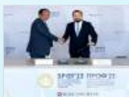
Signing MOU with Roscongress Russia