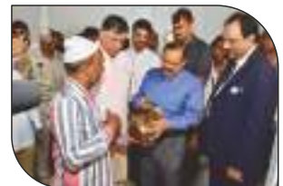
Dr. Jitendra Singh, MOS, Ministry of Personnel, Public Grievances & Pensions-2017