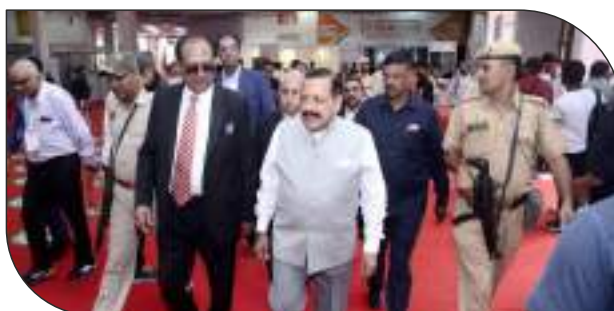
Dr. Jitendra Singh, MOS, Ministry of Personnel, Public Grievances & Pensions-2022