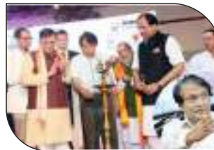
Sh. Suresh Prabhu, Former Minister of Civil Aviation-2018