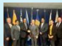
Suffolk County, NY, USA with his team