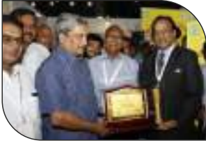
Sh. Manohar Parrikar, Former Minister of Defence-2016