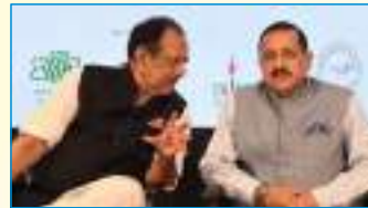
Dr. Jitender Singh Union Minister (MOS) Prime Ministers Office (PMO)