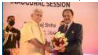
Sh. Manoj Sinha Lieutenant Governor of Jammu & Kashmir