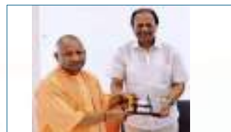
Sh. Yogi Adityanath, Chief minister of Uttar Pradesh