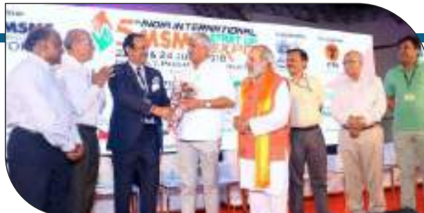
Sh. Gajendra Singh Shekhawat, Minister of Culture-2018