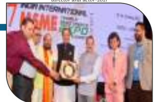
Dr. Jitendra Singh, MOS, Ministry of Personnel, Public Grievances & Pensions-2021