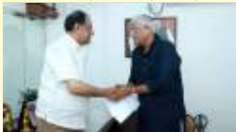
Sh. Gajendra Singh Shekhawat Minister of Culture and Tourism