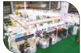
MSME Expo Stalls