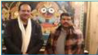
Sh. Dharmendra Pradhan, Union Minister of Education, Skill Development & Entrepreneurship