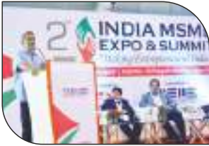
Sh. Manohar Parrikar, Former Minister of Defence-2015