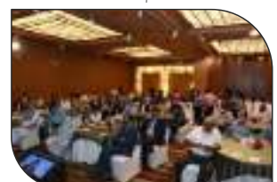
MSME Expo Conference Hall