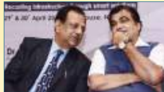
Sh. Nitin Gadkari, Union Minister of Road Transport & Highways