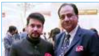
Sh. Anurag Thakur, Union Minister of I&B, Youth Affairs & Sports (Former)