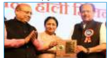
Smt. Rekha Gupta, CM & Sh. Vijender Gupta, Speaker of Delhi Government