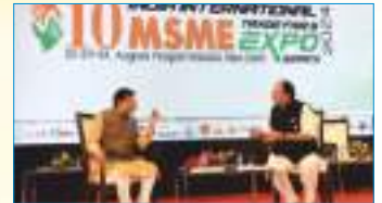
Sh. Piyush Goyal Union Minister of Commerce & Industry