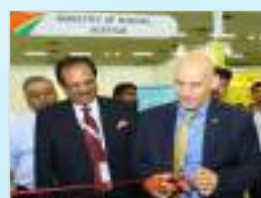
Ambassador of Israel