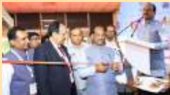
Sh. Om Birla Speaker of Indian Parliament